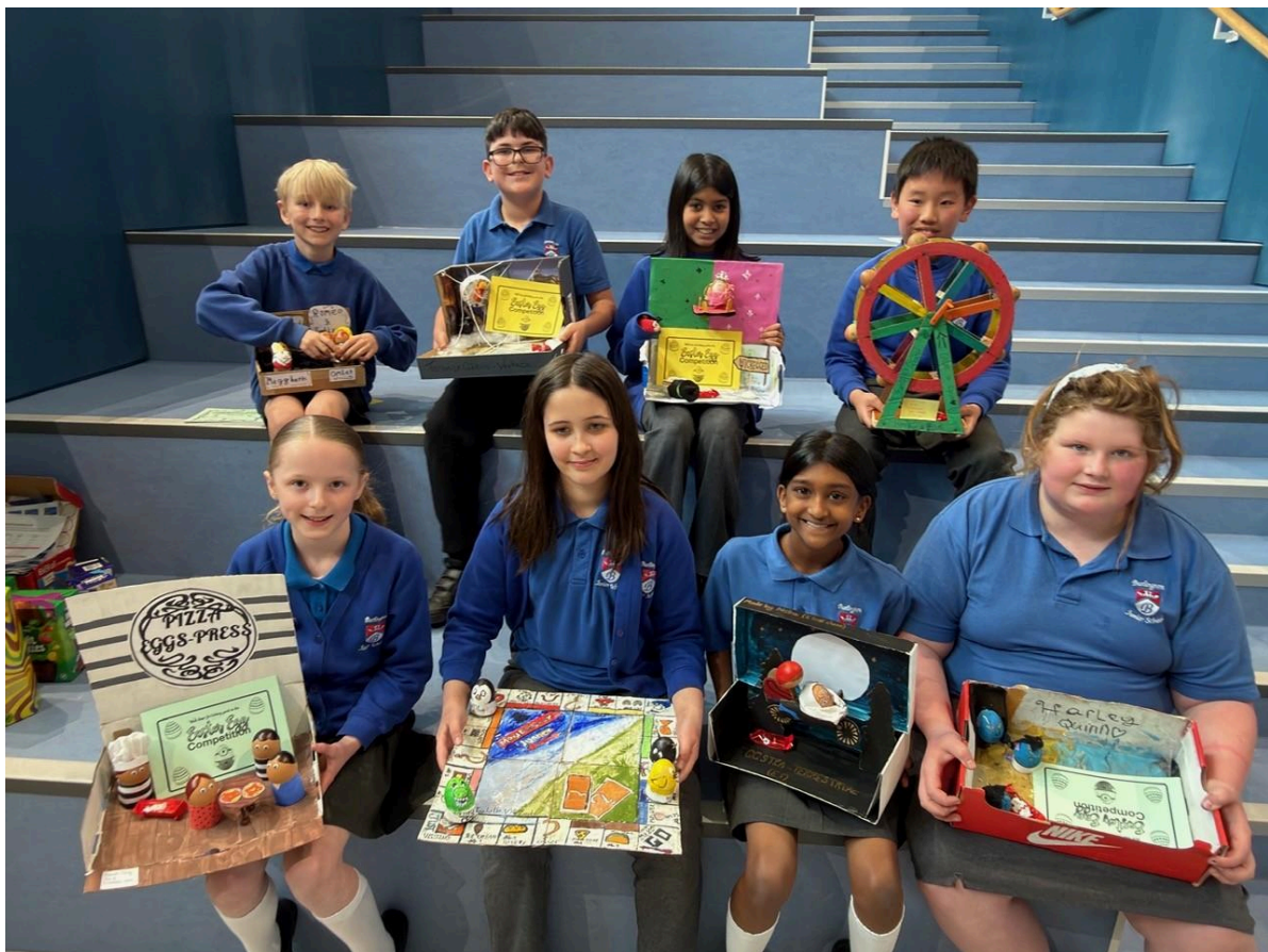
Year 5 and 6 Winners