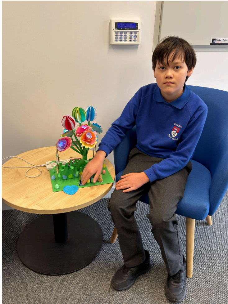
Special commendation award