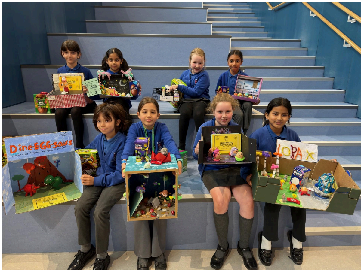
Year 3 and 4 Winners