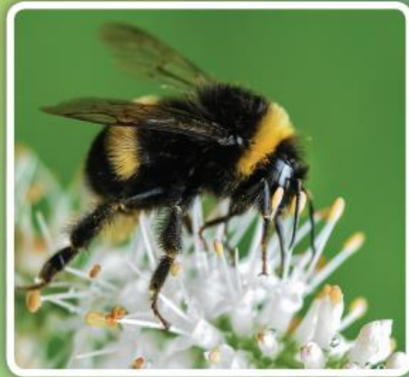
Fact Sheet: About Bumblebees