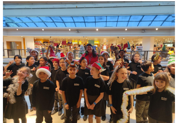
Year 5 at Fenwicks (Bentalls)