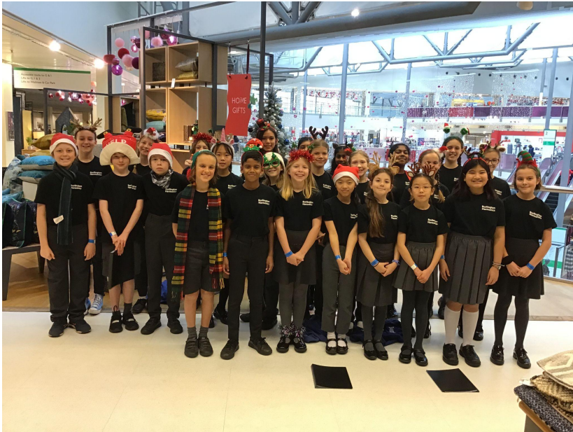
Year 6 at John Lewis